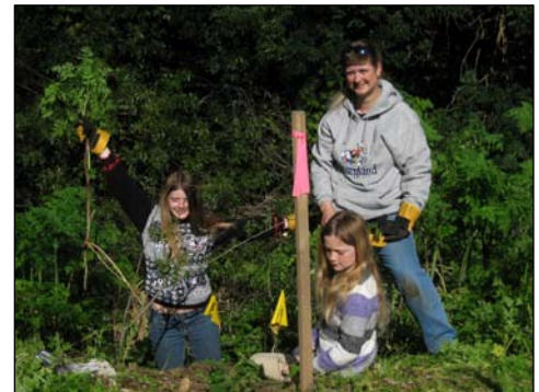
Volunteers weeding around newly planted natives, restoring the creek habitat.

We restore Mount Diablo’s lands – Currently Save Mount Diablo owns nine properties. Before transferring properties to public agencies, we care for the land by leading volunteer work projects to clean up debris and hazards, improve habitat, and provide trails for recreation. One example: Marsh Creek is an important wildlife corridor in an area that is almost completely surrounded with preserved land. With the help of more than 100 volunteers, we removed non-native plants and planted natives on Marsh Creek-IV, a small property with a sublime section of the creek. Volunteers will continue to weed and water the native plants to encourage the natural habitat and wildlife to flourish again. We continue to acquire new parcels along Marsh Creek and restore the creek’s natural habitat.